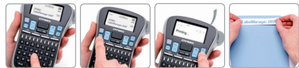
1.Type 2.Customise 3.Print 4.Stick